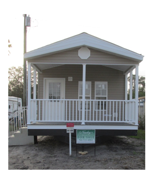
1st of 3 NEW 2016 Homes has arrived ...