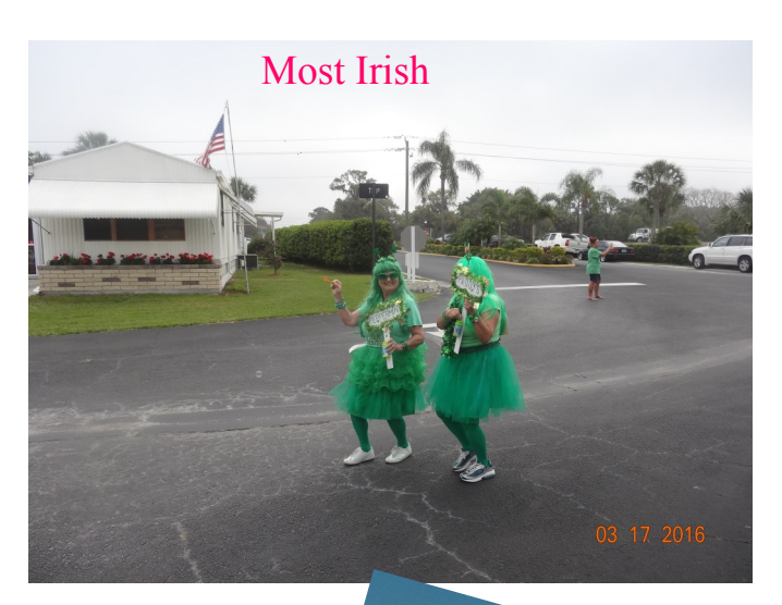
Next Year's Theme (2017)—